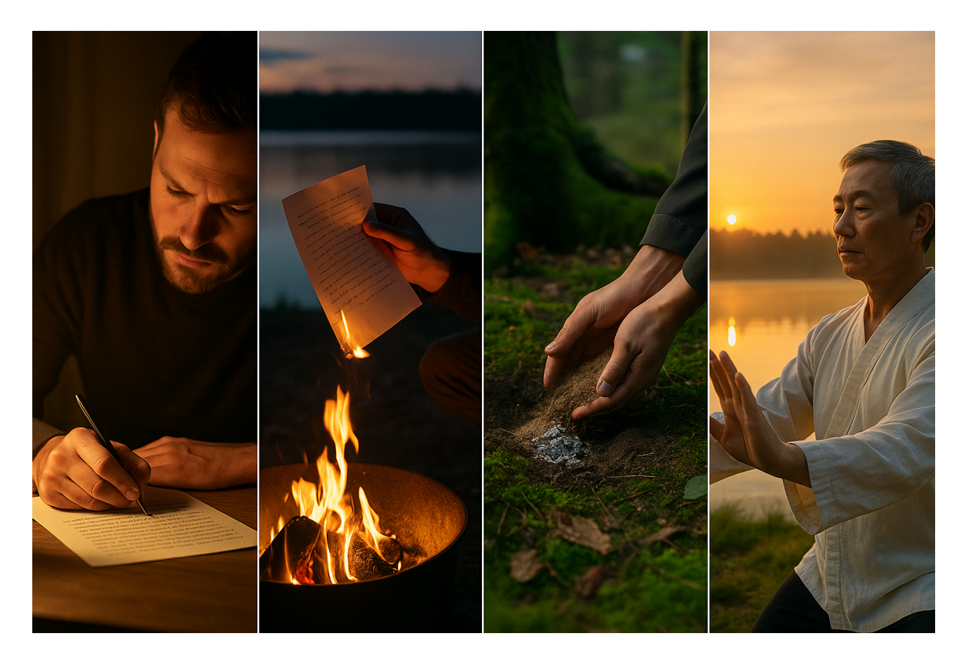
Part Two: Taoist Cleansing Ritual - Symbolism Meets Science

Now that you've identified the external programs shaping your identity, it's time to cleanse them. In ancient Taoist practice , rituals were used to wash away spiritual impurities and realign with one's true nature. Our DIY ritual is inspired by those traditional elements, but we'll explain each step with modern psychological and neuro scientific insights. The ritual has three major phases – Writing the Formulas , Energy Exchange , and Ritual Release – each corresponding to elements of fire, water, and earth for symbolic power.